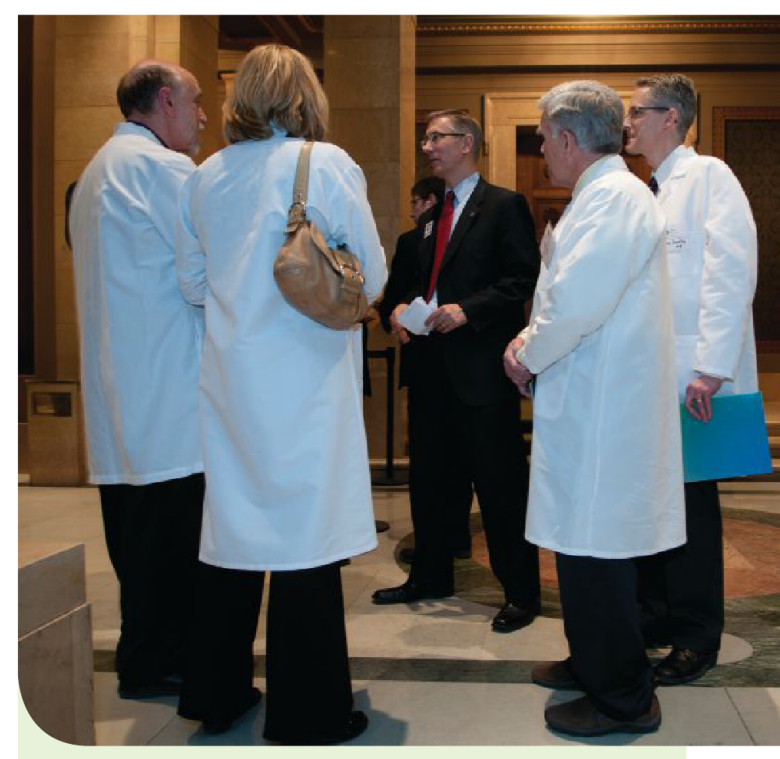
Physicians in white coats will descend upon the Capitol again in February.

The MMA will work with legislators to address workforce shortages, while supporting a collaborative practice framework with physicians.