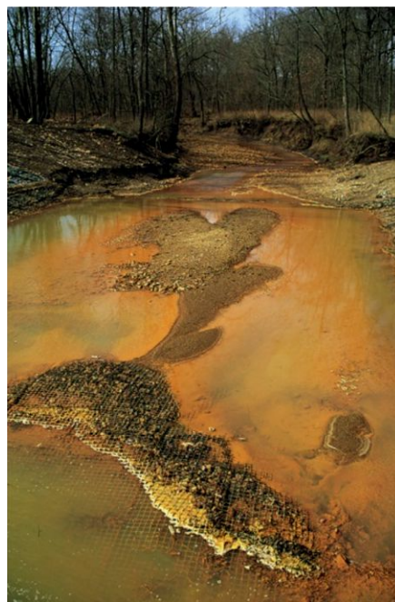
Iron hydroxide precipitating in a stream can be seen as the yellow-brownish discoloration sometimes referred to as “ochre” or “yellowboy.”

minerals. The atmospheric oxidation of pyrite ultimately results in the release of sulfuric acid. 3 Under certain conditions, ferric iron ( \text{Fe}^{3+} ) remains soluble in acidic outflows and forms the reddish-orange to yellow ferric hydroxide ( \text{Fe}(\text{OH})_3 ), a precipitate often recognized as the hallmark of waters containing acid mine drainage 3 (Figure 2).