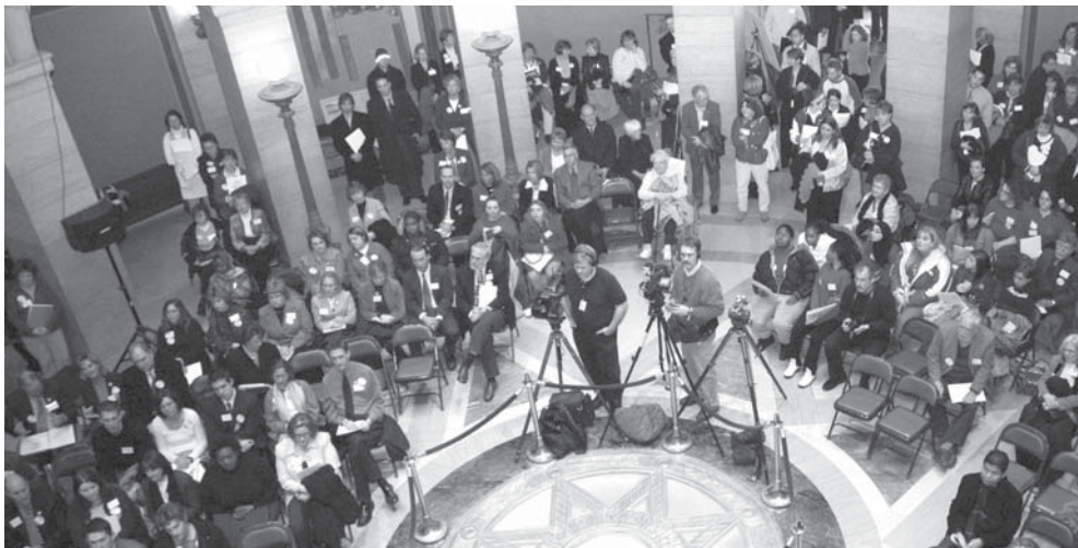
Smoke Free Minnesota Day at the Capitol drew the largest ever gathering of supporters of a statewide smoking ban in all workplaces.

Physicians representing the MMA have been in front of House and Senate committees testifying in favor of a comprehensive statewide smoking ban in all workplaces.