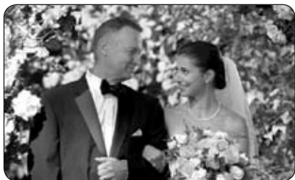
Scenes from “Down the Aisle.”

Both this ad and another, “The Wait,” which began running in October, were